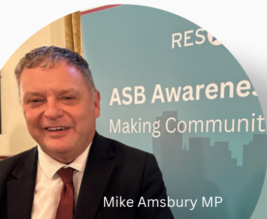
Mike Amsbury MP

Being a member of Resolve gives you a voice and allows you to have input and shape national policy.